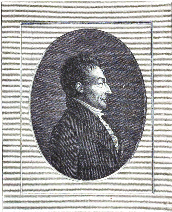
C. F. VOLNEY.